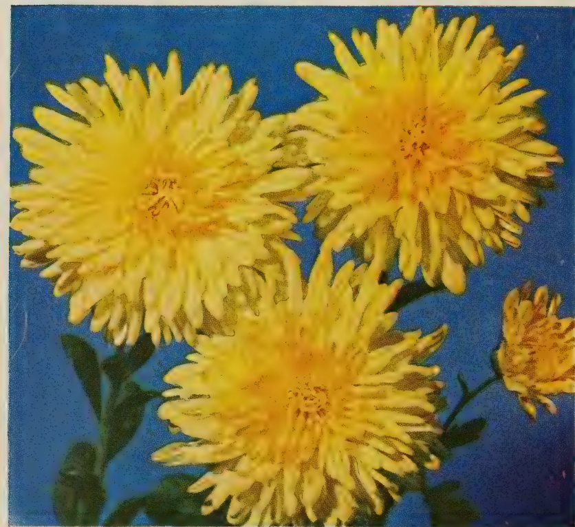
YELLOW AVALANCHE. 50c each; 3 for $1.25